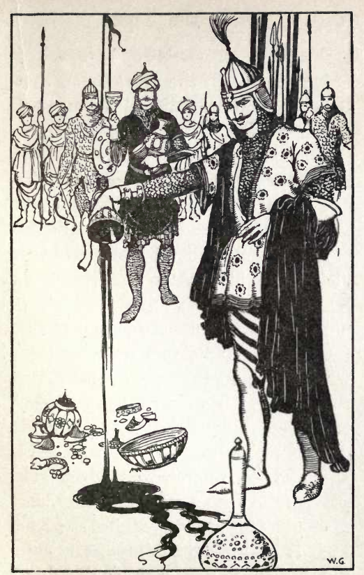
Baber's Vow 57