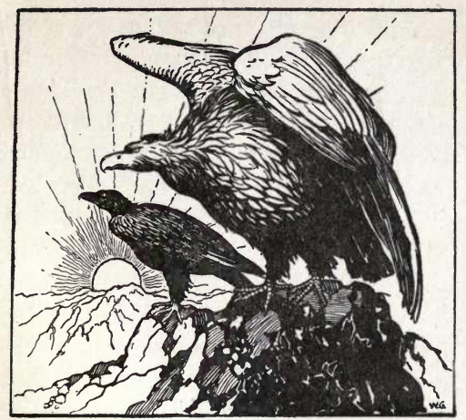
The Eagle Brothers

as children they talked of the wonders of the heavens. And always and always in their talk Little-Eagle Sanpati noticed one yearning in the big brother whom he loved and admired.