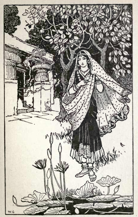
She came to a great house