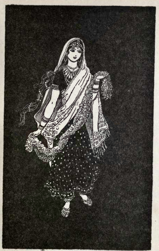
Lightly she held the garland