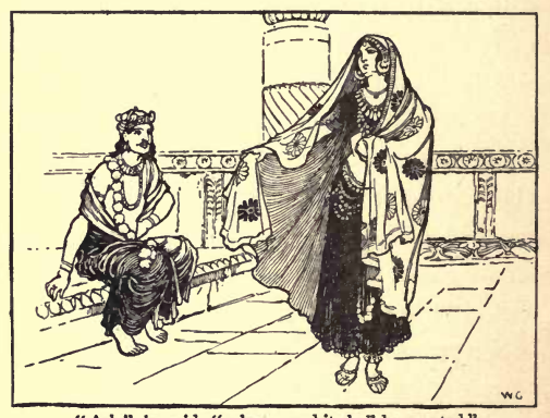
"Ask", he said, "a boon, and it shall be granted"

"Granted," said the enemy, for he did not dare break his word. But he marvelled that she did not ask for herself; so, "Ask again" he said.