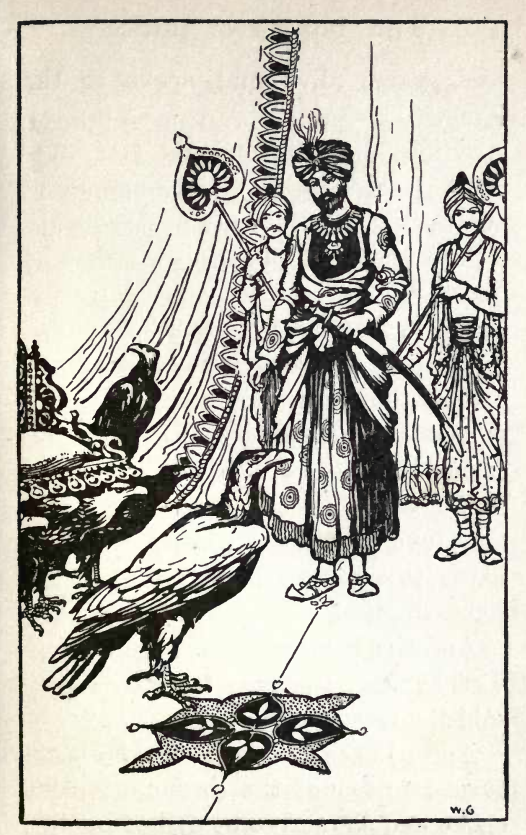
One of the carven eagles came alive