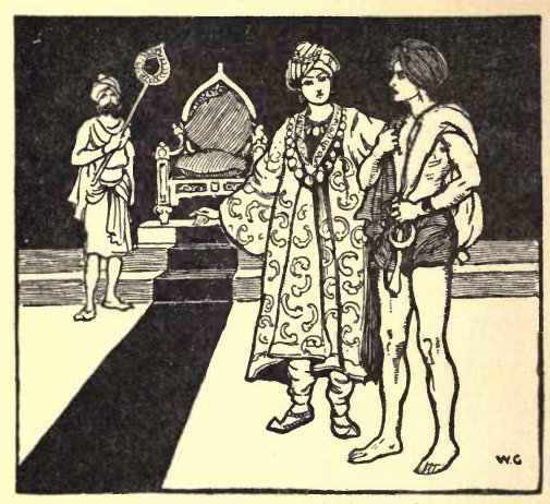
The Water-carrier claims his reward