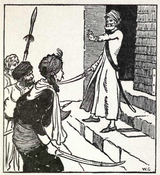
"Nay-not while he is my guest"

fect host: his horse stood beside him ready for a journey.