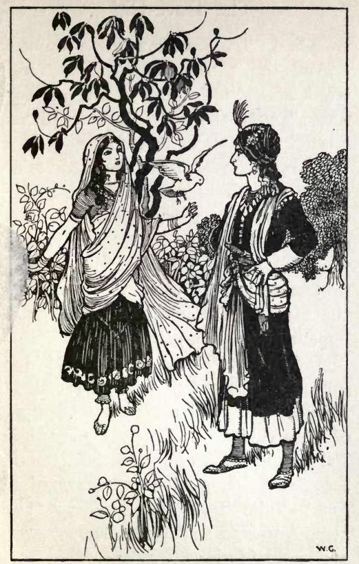
The second dove also flew happily away