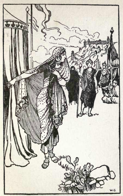
The Lotus-Lady at the prisoner's tent