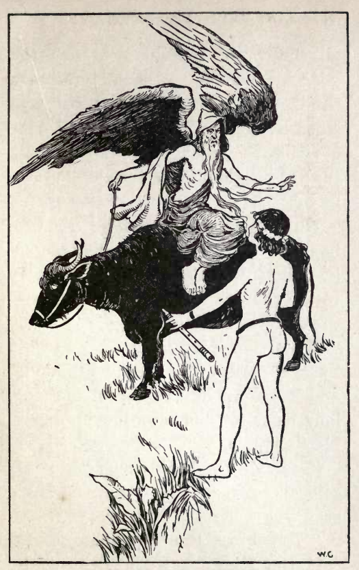
"I am Death, who sent to fetch you"