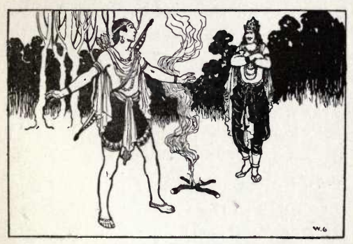
Drona and the Fire of Friendship

And of all Drupada's riches—treasure of gold and emeralds and diamonds and pearls, strings of camels and horses