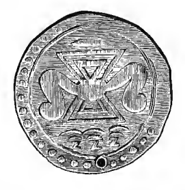
Silver medal of Bodoahpra, supposed to be intended to be deposited in the relicchamber of the pagoda at Mengun.