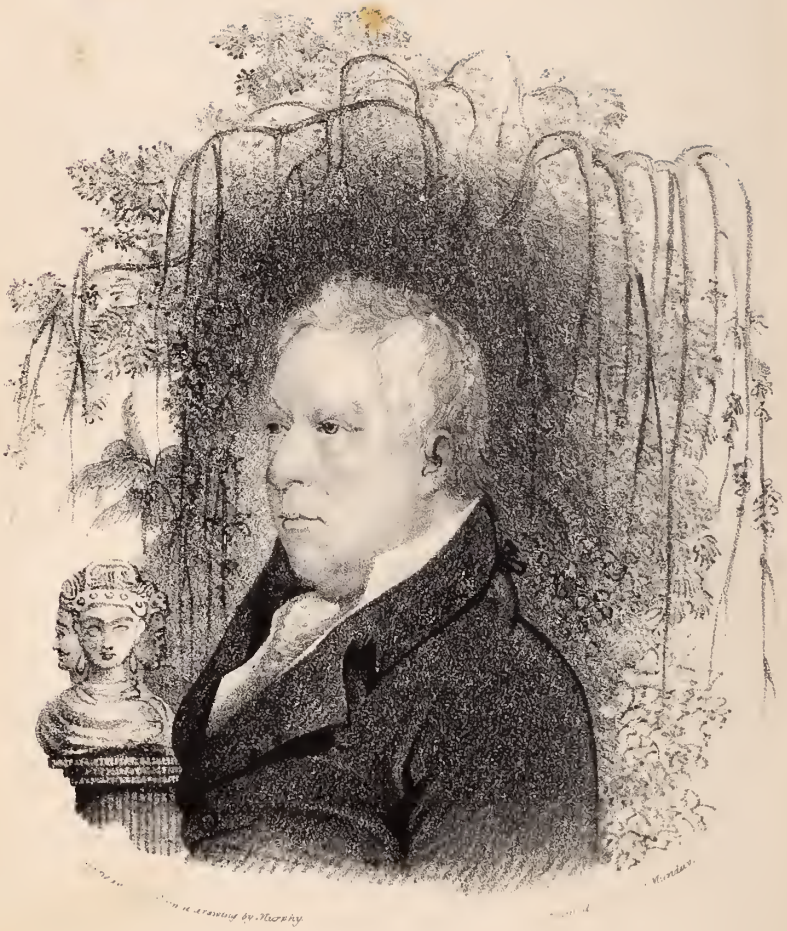
JAMES FORBES ESQ r F. R. S. F. A. S. & C.