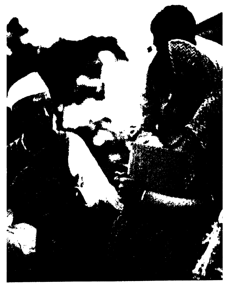
Indira Nehru, Jawaharlal's daughter