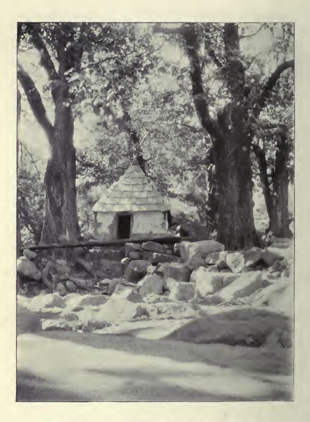
TEMPLE OF NAGINI DEVI NEAR CHAMBA.