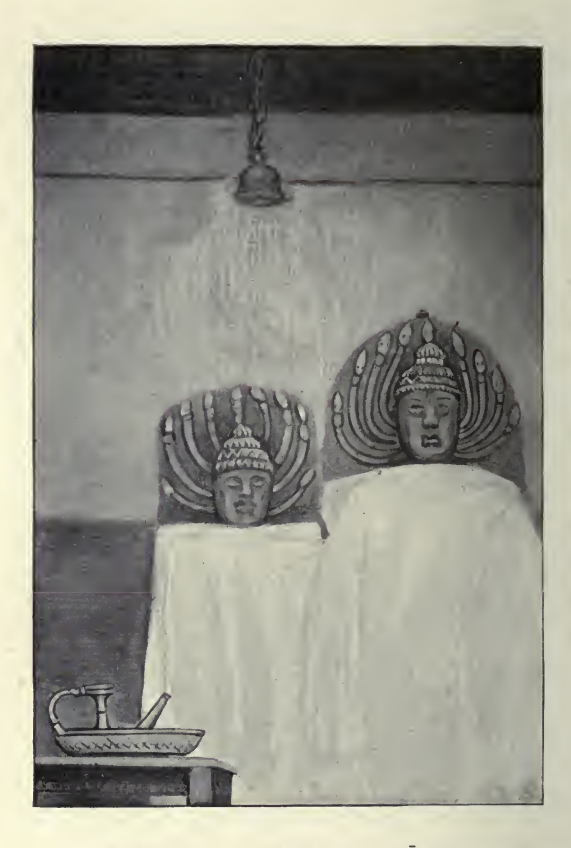
INTERIOR OF TEMPLE OF BASDEO, GHATI, BADARIWAR.