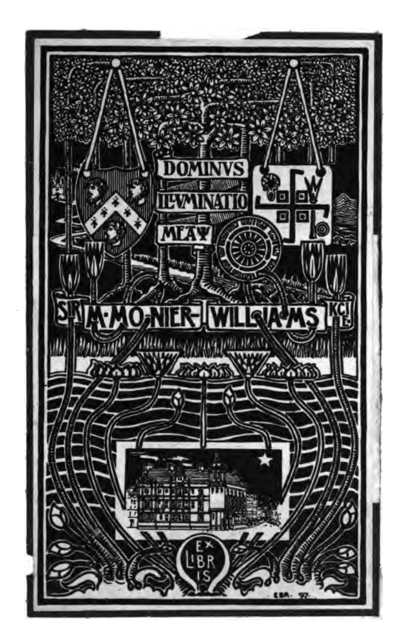
23 A. 48